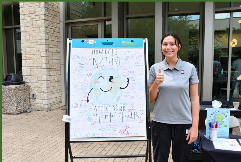
University Health Services reminding us about mental health!