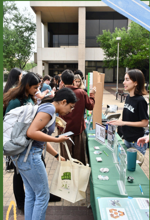
Participants turning in their passports.