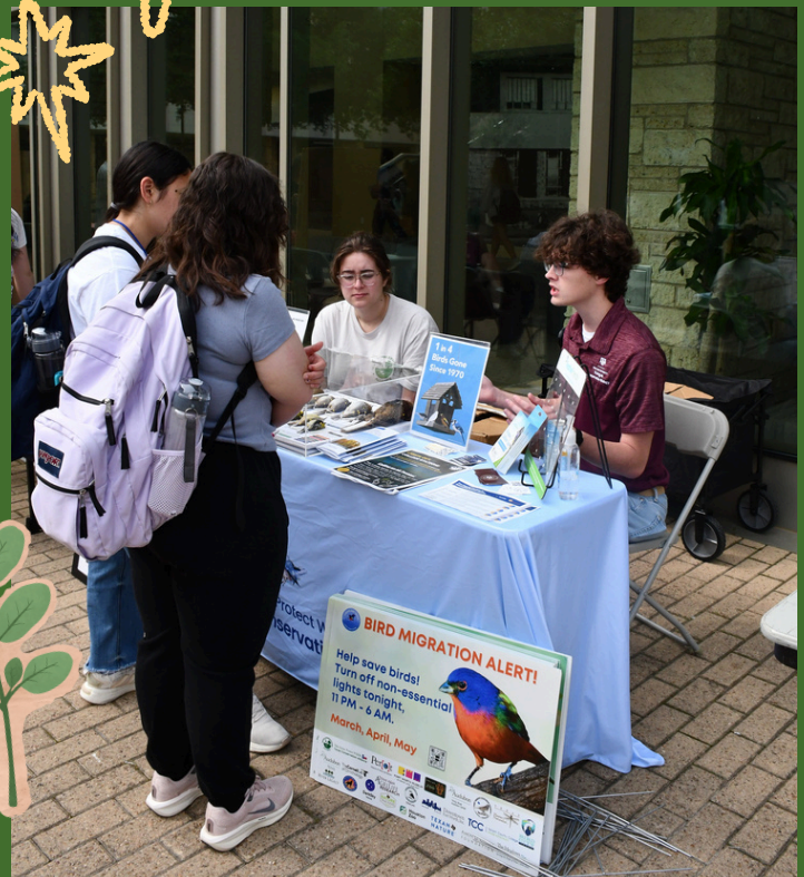
Texas Conservation Alliance teaching us about bird migration!