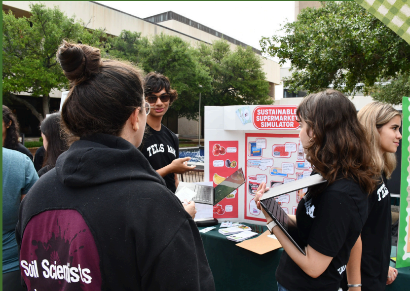
Interns hard at work talking about sustainable shopping!