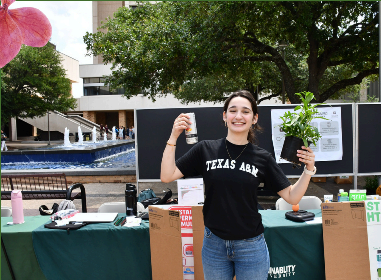
Sustainability Intern showing off the plant she got from one of the other tables.