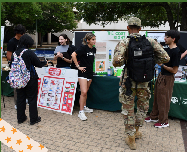
Interns talking about greenwashing.