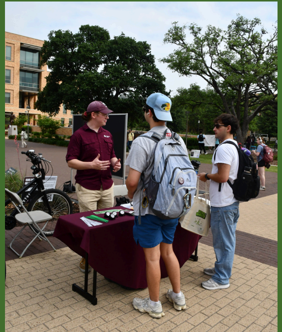
TAMU Transportation Services & their bike service!