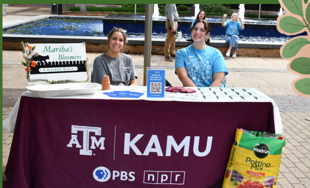
Visitors to KAMU's table got to do seed planting to take home.